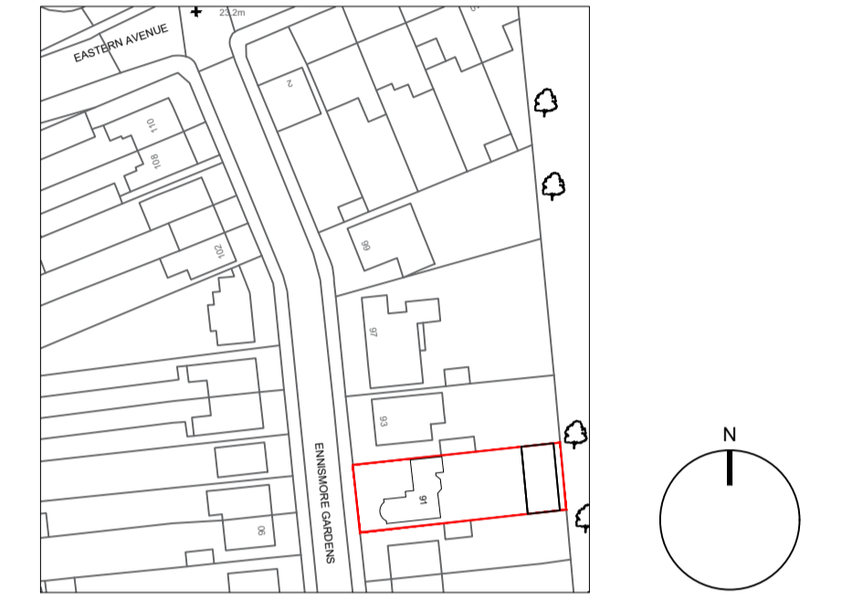
PROPOSED LOCATION PLAN - 1:1250

Interior Ridge Height EL. +2.725m Exterior Ridge Height EL. +2.547m Loft EL. +3.000m First Floor CH EL. +2.445m First Floor FFL EL. +2.000m Ground Floor CH EL. +2.075m Ground Floor FFL EL. 0.000m Rear G. EL. -0.185m