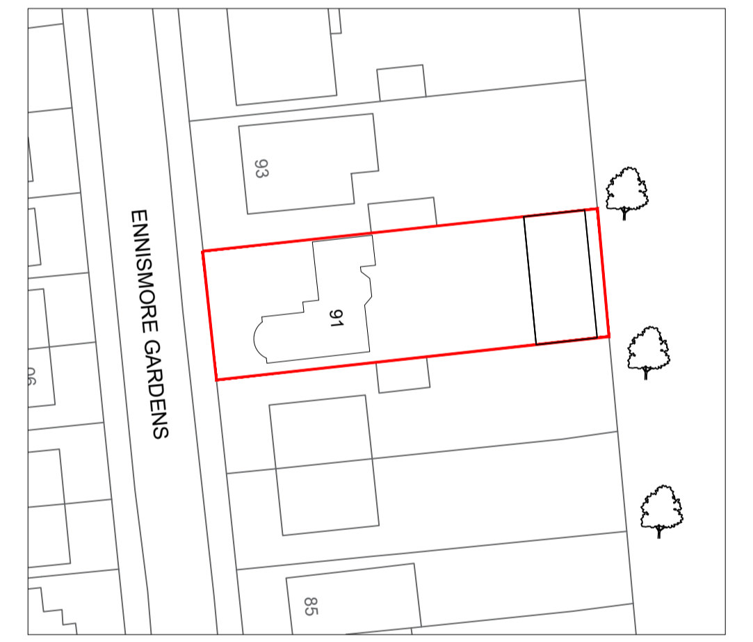
PROPOSED BLOCK PLAN - 1:500