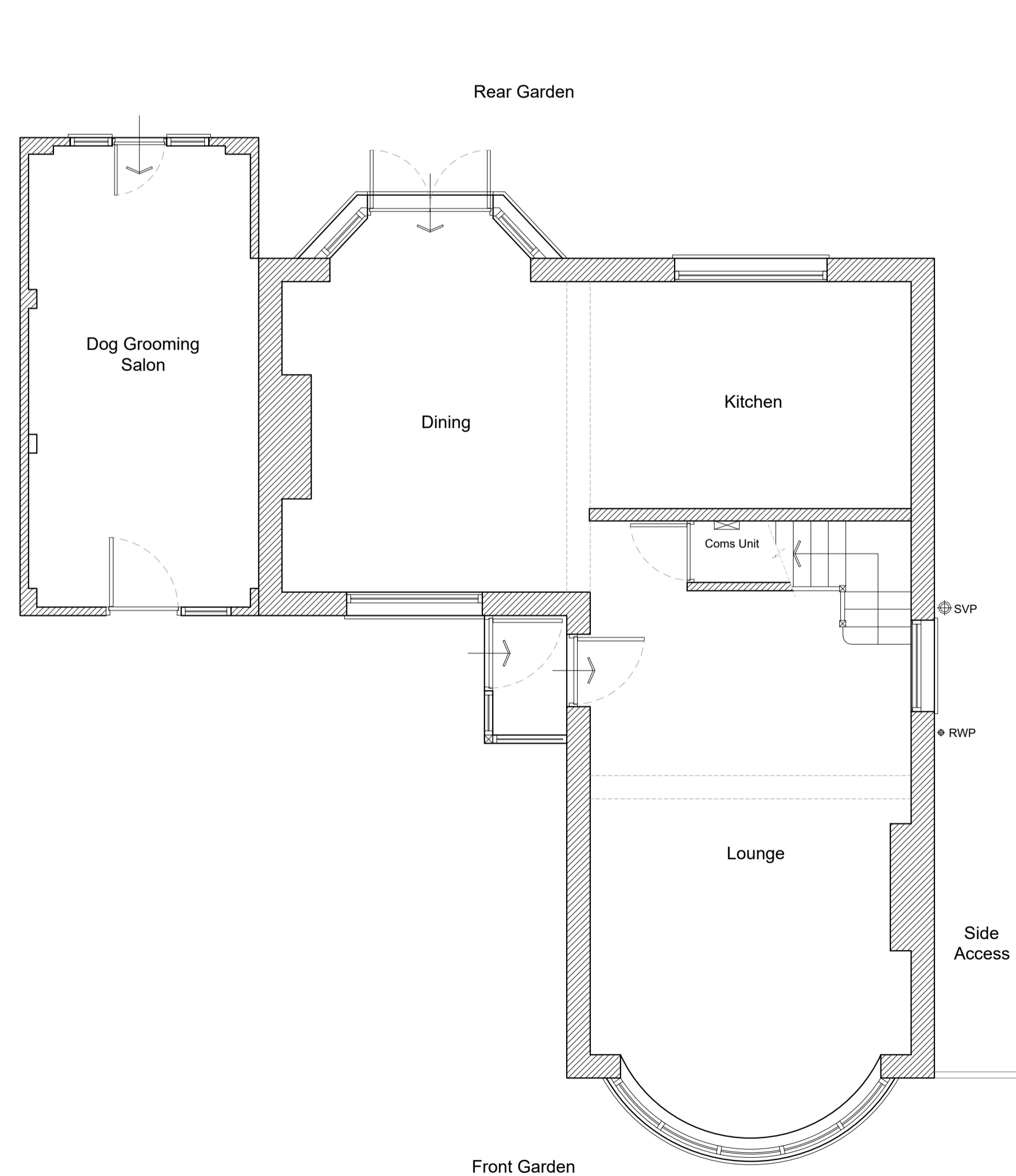
G Proposed Ground Floor Plan 1:50 1m 0 1m 2m 3m 4m 5m